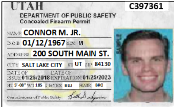
Concealed Permit Front