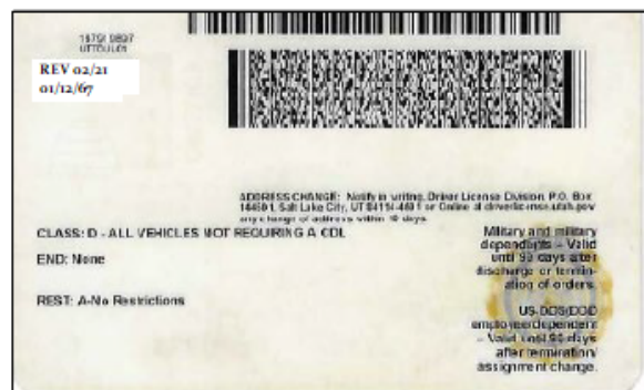
Driver's License Back